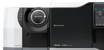
Fig.2 Shimadzu GCMS-TQ™8040 NX