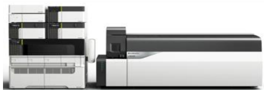
Fig. 1 Shimadzu LCMS™-8045