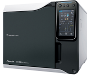
> Nexis™ GC-2030 Gas Chromatograph