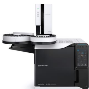
Figure 2: Nexis™ GC-2030 system

This application note demonstrates the determination of organic impurities from valproic acid as per proposed USP monograph GC method using Shimadzu's Nexis GC-2030 system. (Figure 2)