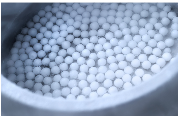
Figure 3: With dual nozzle option up to 7,000 beads can be generated per hour.