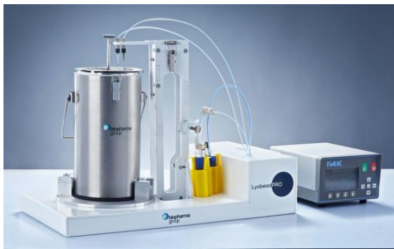
Figure 1: LyobeadPRO™ device