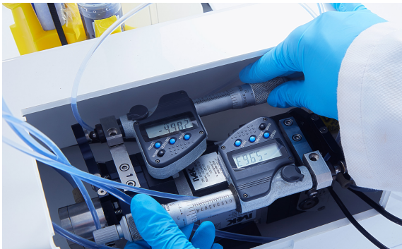
Figure 2: Built in pump and adjustment controls. Volume precision 0.10%