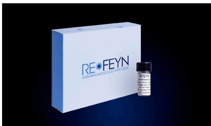
Fig. 1. SizeFERENCE. Each vial of SizeFERENCE contains 0.3 mL of calibrant in suspension.

SizeFERENCE is easy to use and provides a standard reference that ensures reproducibility across measurements, instruments and labs.