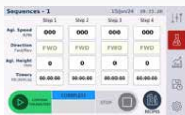
Process Sequence Creation