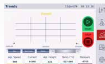
Real-time Process Values